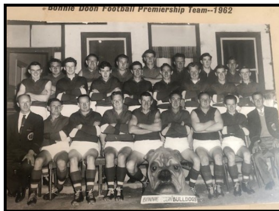
Photo taken from photo at BD Recreation Reserve Hall

- Taken from page 70 (For further reading on the historical and recent success of the club available)