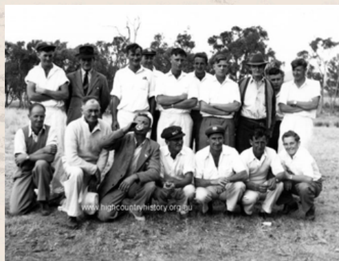
Bonnie Doon Cricket Team 1950's