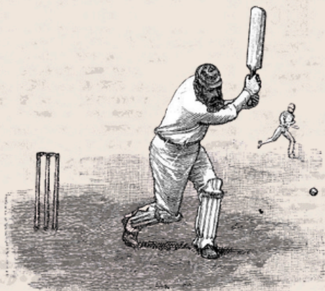
Square-leg hit. (W. G. Grace.)